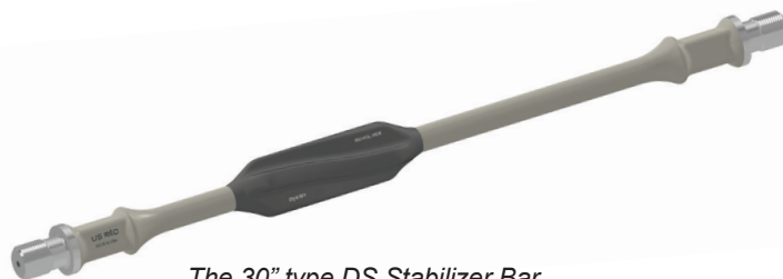
The 30" type DS Stabilizer Bar